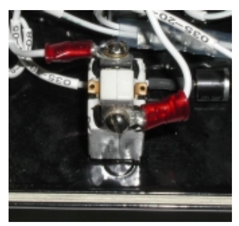
FIG. 2 FIG. 3